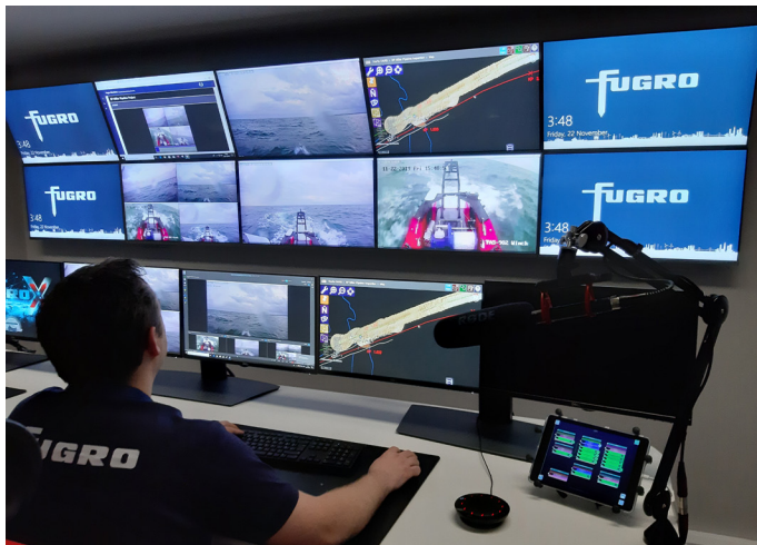
Uncrewed surface vessel operations being monitored from our ROC

As an uncrewed vessel, it eliminates the risks associated with human involvement in offshore operations. With an up to 95% reduction in fuel consumption compared to conventional vessels, it also lays the foundations for more sustainable inspection and survey operations.